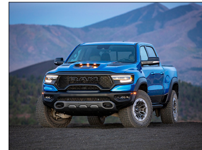
2022 RAM 1500