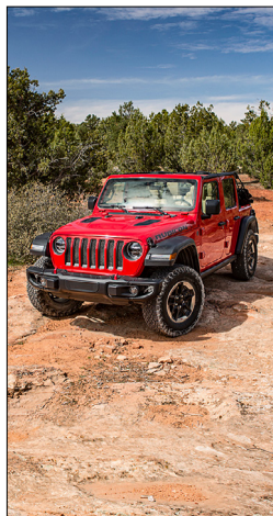
2021 Jeep Wrangler

Jerry Ray Davis CDR+J 3900 Frederica St. Owensboro KY 42301