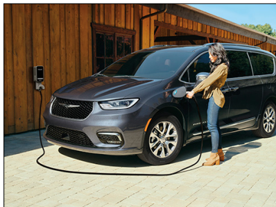
2022 Chrysler Pacifica