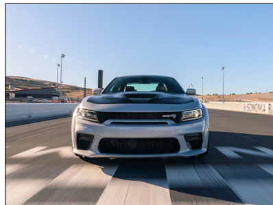
2022 Dodge Charger SRT