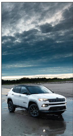
2022 Jeep Compass