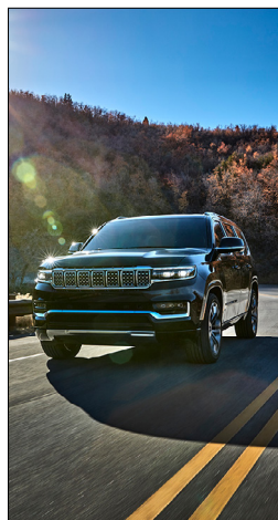
2022 Grand Wagoneer