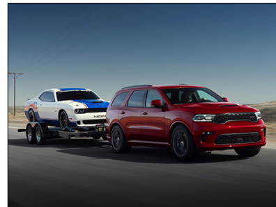
2022 Dodge Durango