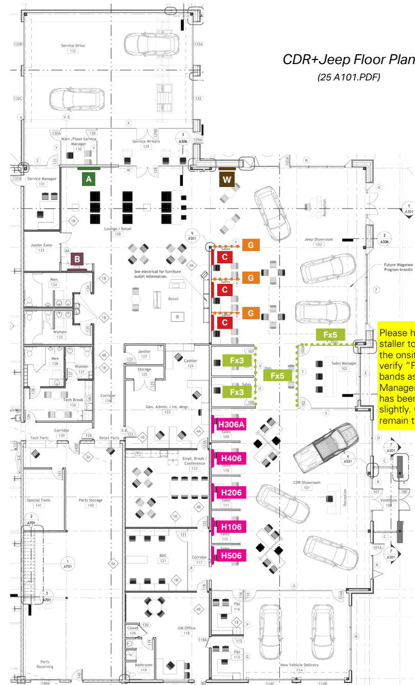
CDR+Jeep Floor Plan (25 A101.PDF)

Please have the installer touch base with the onsite contact to verify "F" distraction bands as the Sales Manager's floor plan has been modified slightly. Quantity to remain the same.