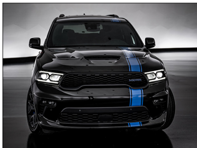
2022 Mopar Durango